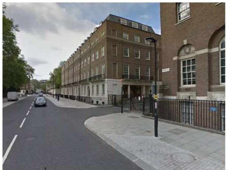
Entrance to Stewart House, looking south ↗

There is good access for wheel chair users at and within Stewart House.