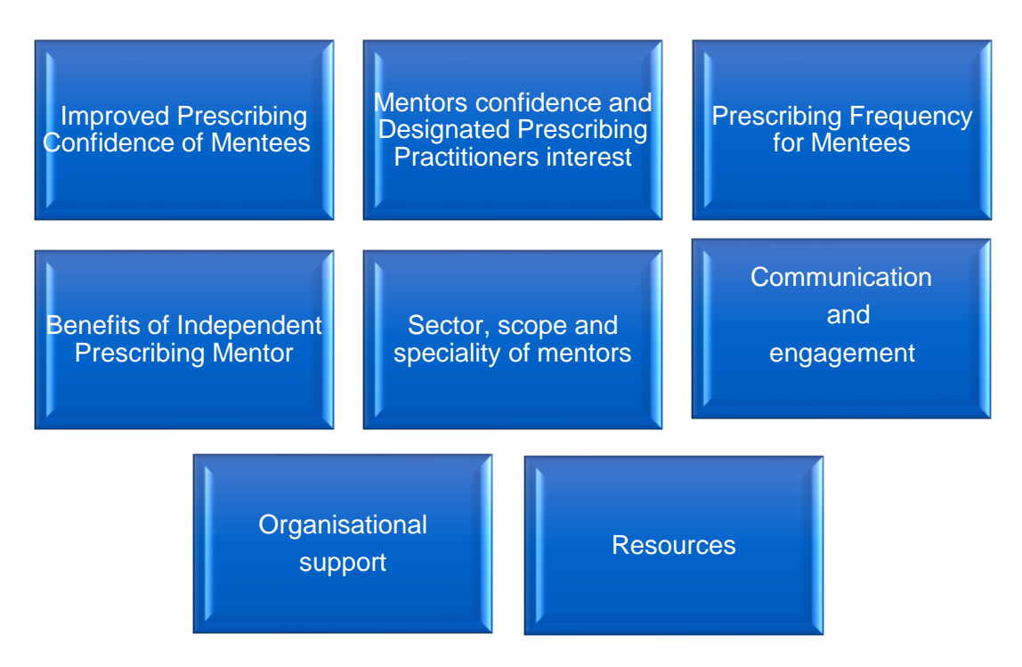
Figure 1 End of project evaluation and focus group response themes

There was overlap in the qualitative data identified between the focus group and end of project survey evaluation responses, therefore the results for both have been grouped together into themes.